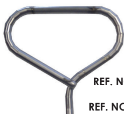
REF. NO. 91683 & REF. NO. 91683-A