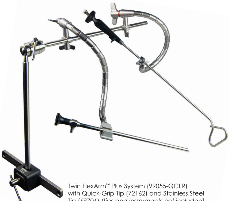
Twin FlexArm™ Plus System (99055-QCLR) with Quick-Grip Tip (72162) and Stainless Steel Tip (69706) (tips and instruments not included)

Mediflex's Lapro-Flex® self-forming articulating retractors allow for convenient and atraumatic retraction of organs and tissues in the peritoneal space. These retractors can be introduced through a 5mm cannula and articulated to their shape by rotating a knob on the handle. They are available in several different configurations including right angle, triangular and angled triangular.