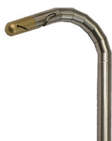
REF. NO. 91680