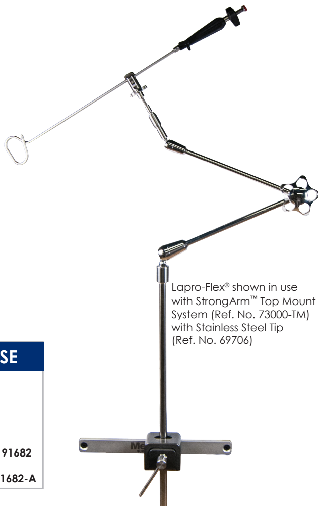
Lapro-Flex® shown in use with StrongArm™ Top Mount System (Ref. No. 73000-TM) with Stainless Steel Tip (Ref. No. 69706)